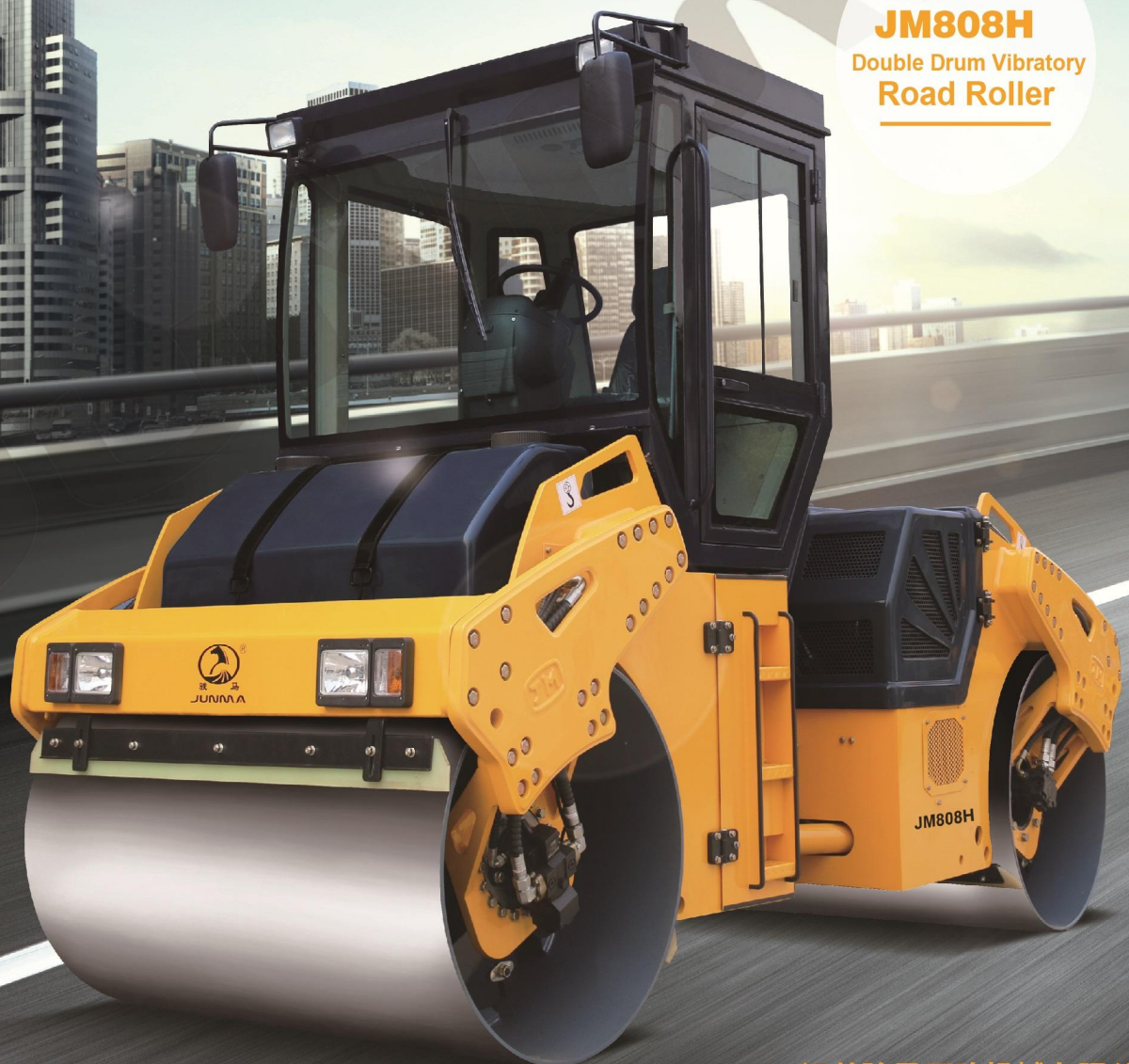
JM808H Double Drum Vibratory Road Roller

ENGINE BRAND CUMMINS ENGINE MODEL 4BT3.9-80 GROSS POWER 60 kW OPERATING WEIGHT 8000 kg